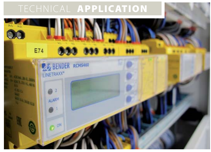
A-feed data centre