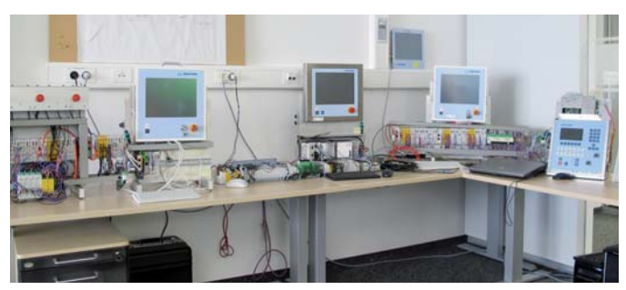
Laboratory IT system supply and MK2430 indicator unit