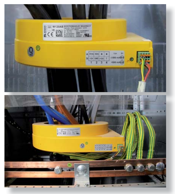
AC/DC sensitive measurement for load installations